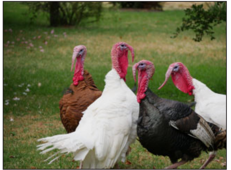
Domestic turkey farmers are concerned with the upcoming spring migration.

A more important biosecurity measure is the line of separation at a barn door, according to Barr. That means