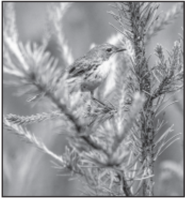
A Kirtland's warbler is perched in a jack pine tree.

The Forest Service offers guided tours of warbler habitat in the Huron-Manistee National Forest and a self-