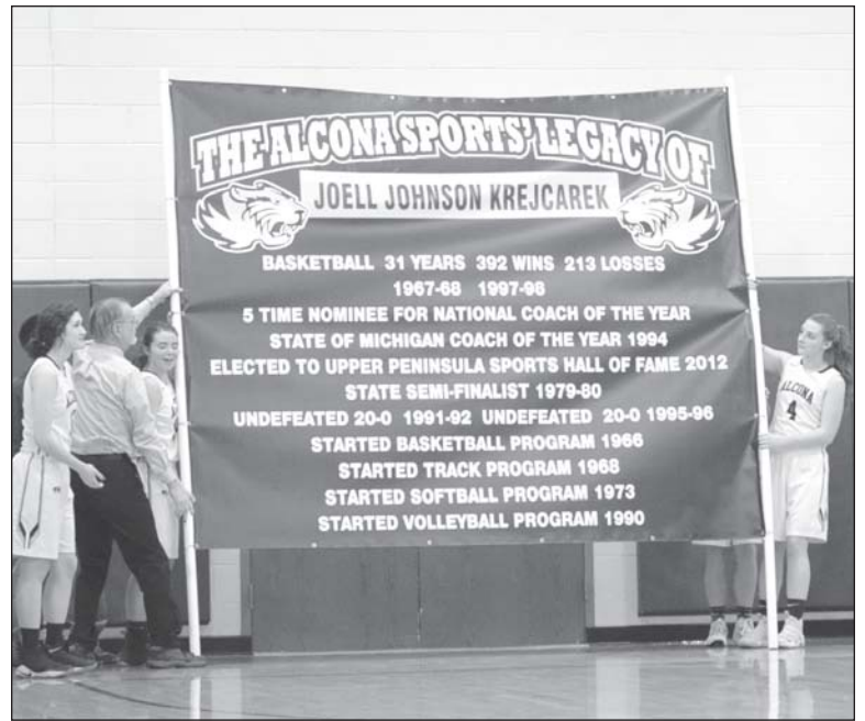
The Alcona girls varsity basketball team displays a banner listing the accomplishments during the half-time tribute at the homecoming game last Friday.