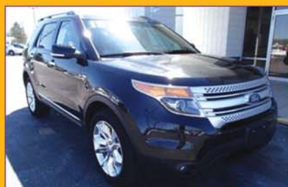
Stock #U4996 NADA Retail $32,550