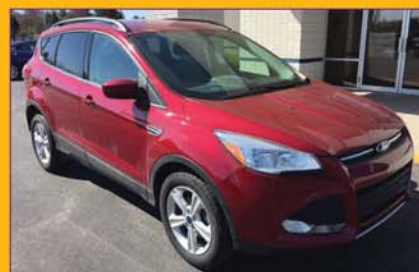
Stock #P5042 NADA Retail $17,775