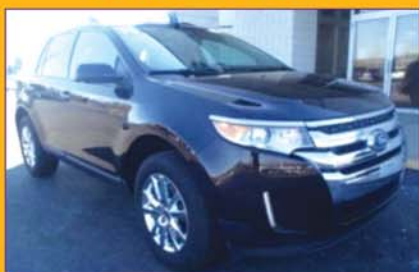
Stock #U4859 NADA Retail $21,525