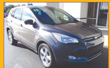
Stock #P5180 NADA Retail $22,075